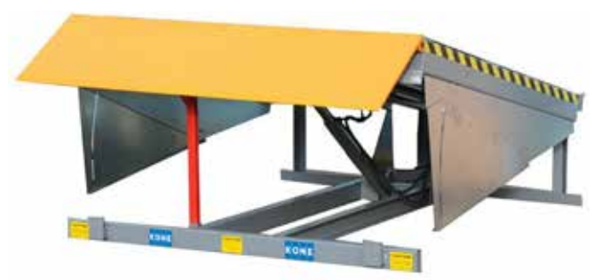
There are two main types of powered Dock Leveller

All fully compliant with the latest March '09 Dock Leveller Regulations 'BS EN 1398 : 2009' Dock Leveller's Safety Requirements.