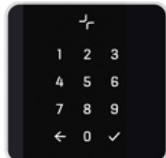
Card reader with PIN