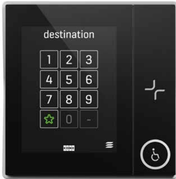
Card reader integrated with KSP 858 touchscreen destination operating panel