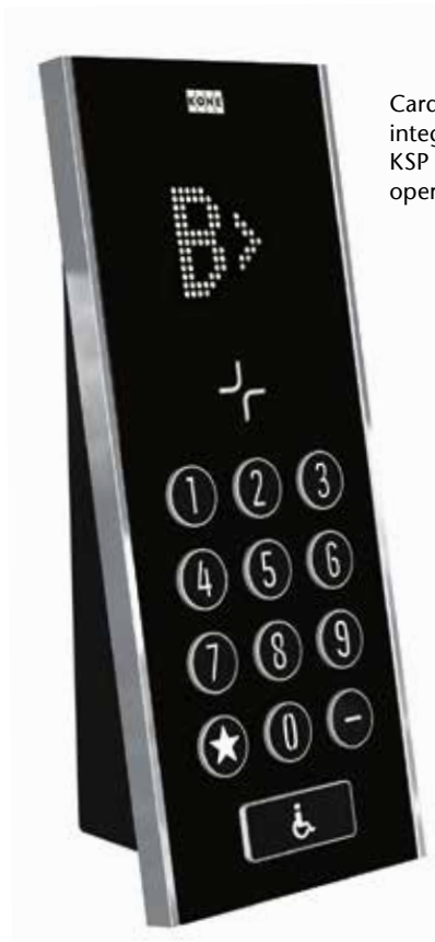
Card reader integrated with KSP 853 destination operating panel