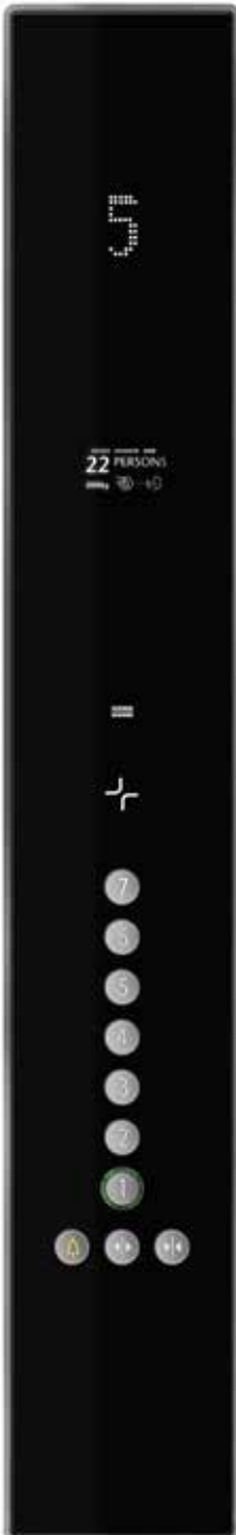
Card reader integrated with KSC D23 car operating panel

Our user-friendly, integrated access and destination solutions are designed to make it easy for people to move throughout your building.