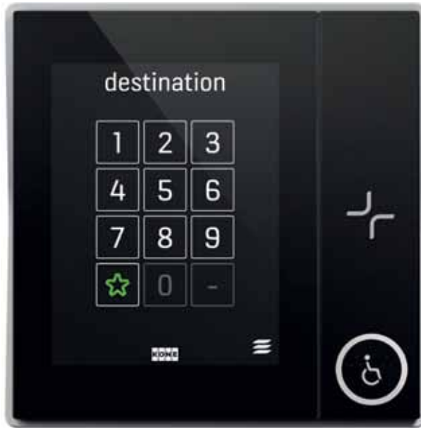
Card reader integrated with KSP 858 touchscreen destination operating panel