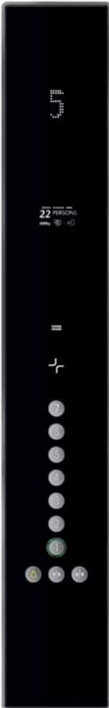
Card reader integrated with KSC D23 car operating panel

Our user-friendly, integrated access and destination solutions are designed to make it easy for people to move throughout your building.