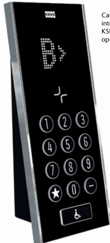
Card reader integrated with KSP 853 destination operating panel