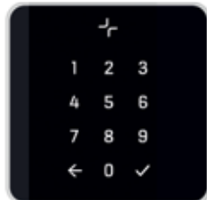
Card reader with PIN